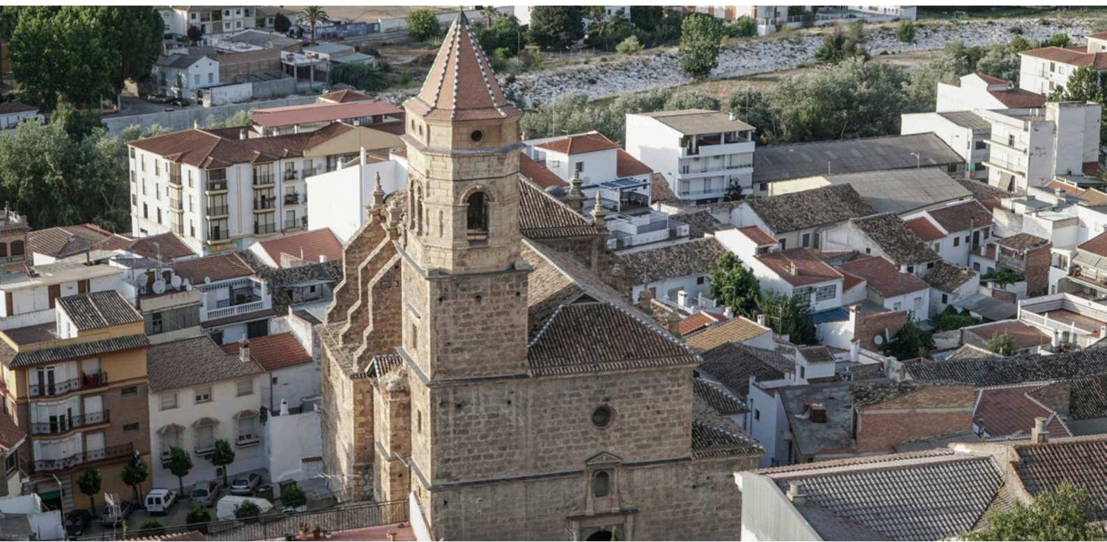
▲ LOJA GRANADA