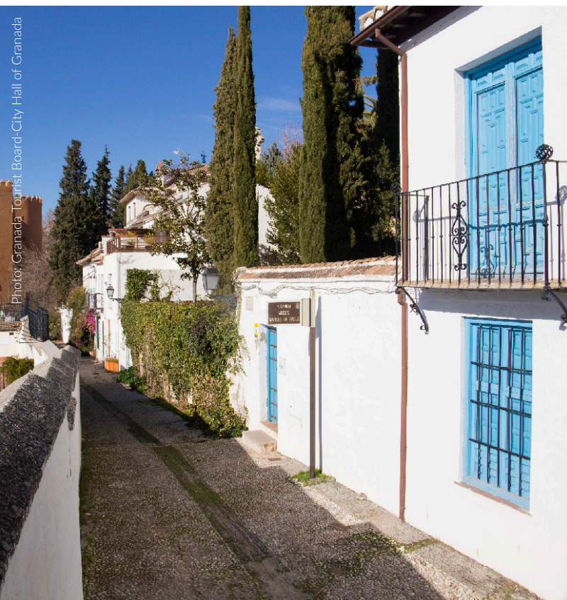
▲ MANUEL DE FALLA HOUSE-MUSEUM