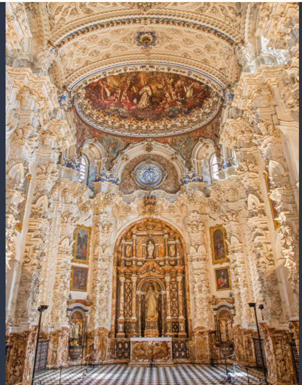
▲ LA CARTUJA MONASTERY