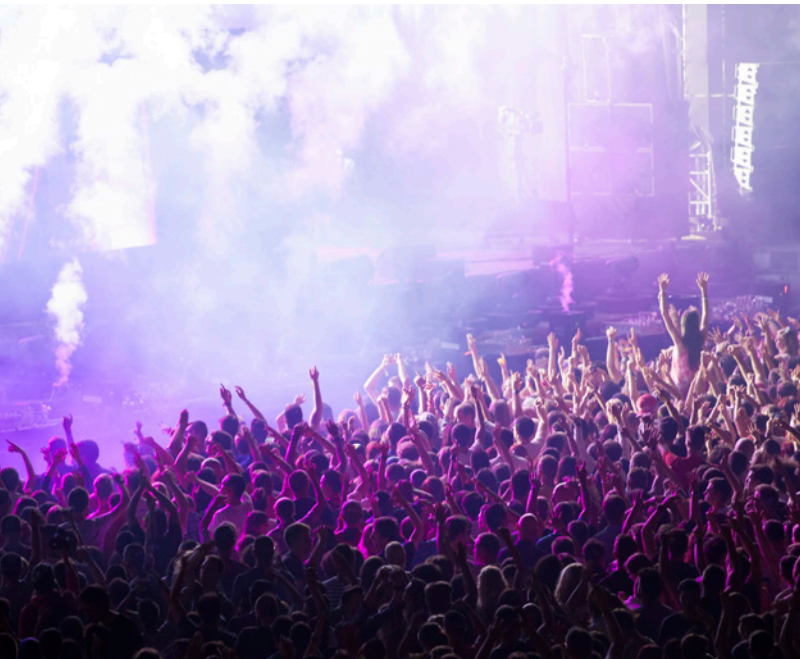
▲ GRANADA SOUND