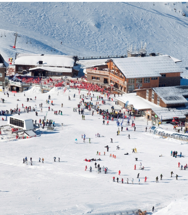
▼ SIERRA NEVADA