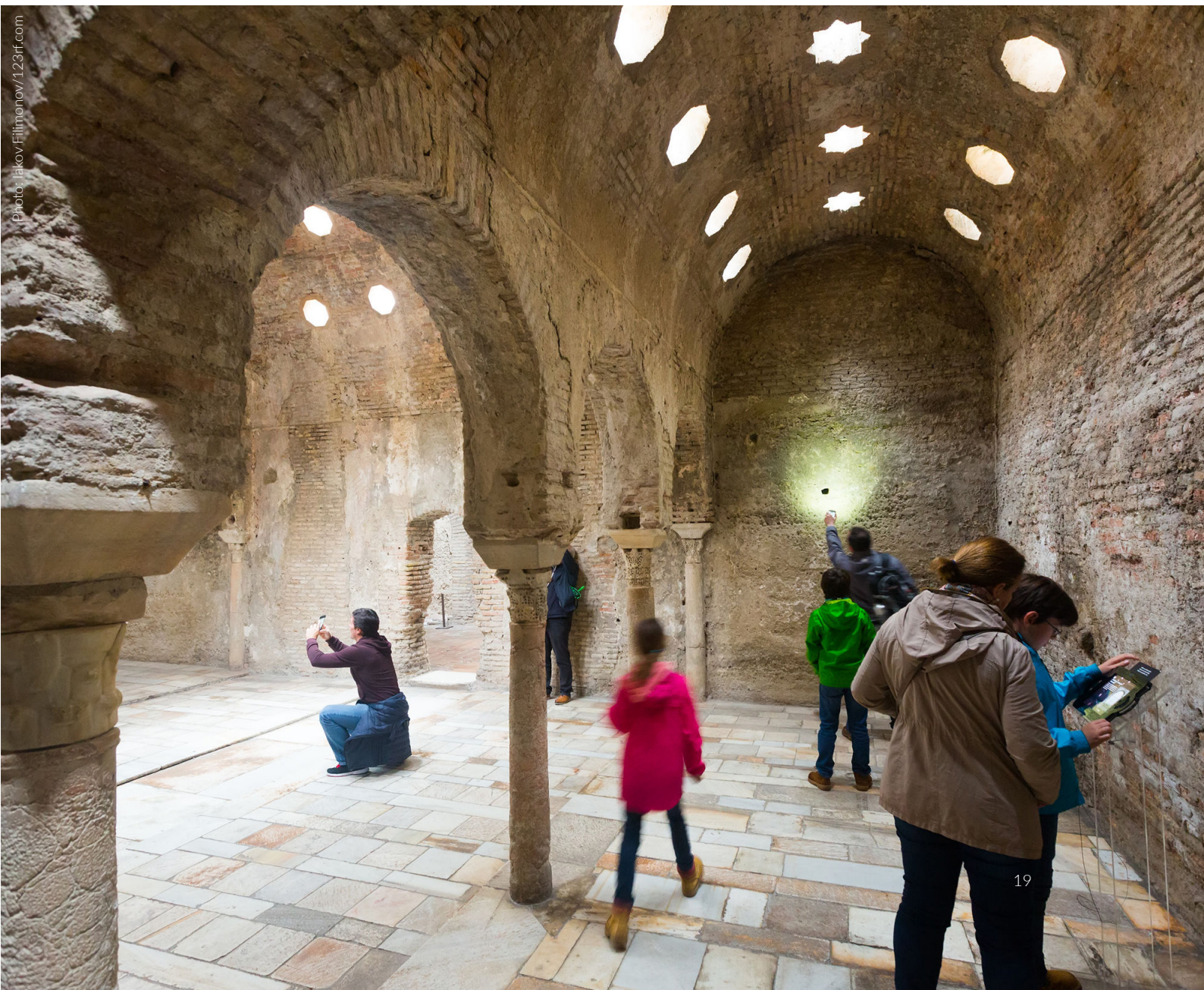
▼ EL BAÑUELO