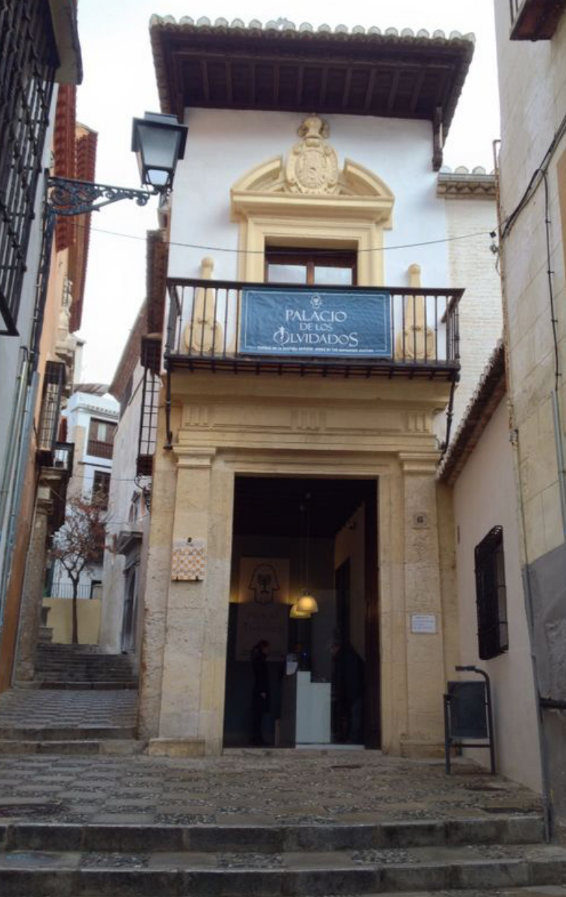
▲ PALACE. OF LOS OLVIDADOS

Ministry of Industry, Commerce and Tourism Published by: © Turespaña Created by: Lionbridge NIPO: 086-18-006-3